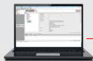
PC/tablet Asset Management Software

The PR backplane offers HART multiplexer access for asset management of all HART equipment including monitoring, status, re-calibration and configuration.