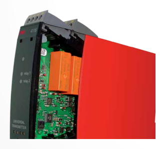
The sophisticated design of 4114, 4116, 4179, 4184 and 4225 makes the devices suitable for application in SIL 2 circuits.