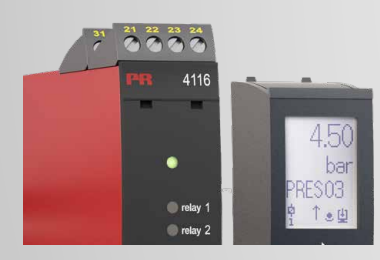
The 4000 series can be delivered pre-configured from factory, but the detachable display fronts 4510 / 4511 / 4512* provide access to advanced configuration directly in the process and allow the user to copy the configuration to other devices or communicate via Modbus (4511) or Bluetooth (4512).