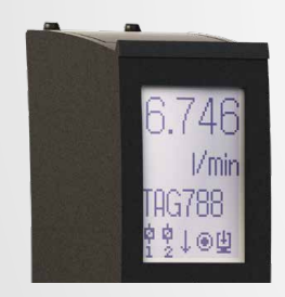
The alphanumerical display ensures easy readability of the process information.